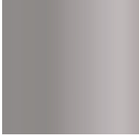
Brushed Aluminum - BAL